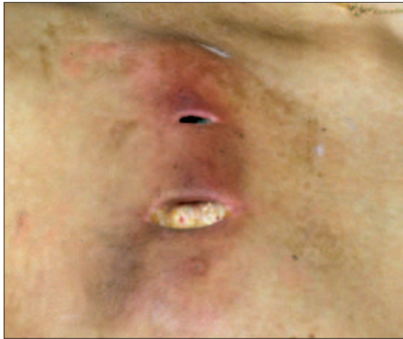
Figure 1: Drained infusion port pocket abscess with evidence of intravascular device-related inflammation