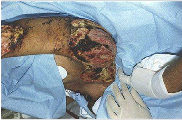
Figure 4. Cutaneous necrotizing mucormycosis of the right upper limb of a burn victim.

these lesions may mimic pyoderma gangrenosum, bacterial synergistic gangrene, or other infections produced by bacteria or fungi (Figure 4) [142].