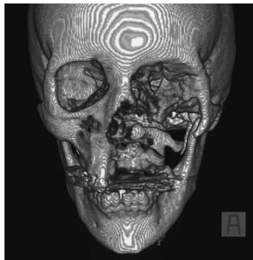
Figure 3. Three-dimensional computed tomographic scan of the facial skeleton of a patient with rhinocerebral mucormycosis showing extensive skeletal defects after orbitomaxillary resection.

Magnetic resonance (MR) imaging is quite useful in identifying the intradural and intracranial extent of ROCM, cavernous sinus thrombosis, and thrombosis of cavernous portions of the internal carotid artery. Contrast-enhanced MR imaging can also demonstrate perineural spread of the infection. Although evidence of infection of orbital soft tissues may be seen on CT scans, MR imaging is more sensitive for this [114, 135]. Still, as with CT scans, patients with early ROCM may have normal MR images, and high-risk patients should always undergo surgical exploration with biopsy analysis of the suspected areas of infection. Nevertheless, imaging studies are nonspecific for ROCM, and diagnosing ROCM almost always requires histopathological evidence of fungal tissue invasion. Given the rapidly progressive nature of ROCM and marked increase in the mortality rate when the fungus penetrates the cranium, any diabetic patient with